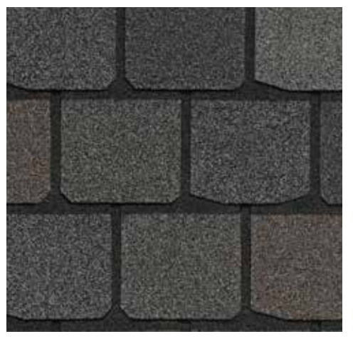
New England Slate