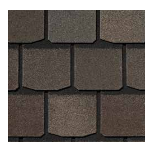
Max Def Weathered Wood